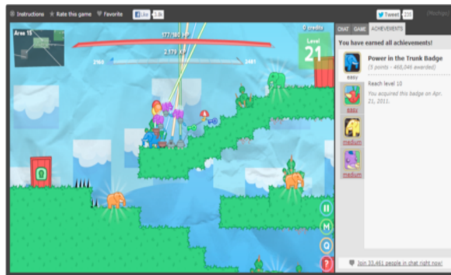
Figure 2. Game 2 - Elephant Quest