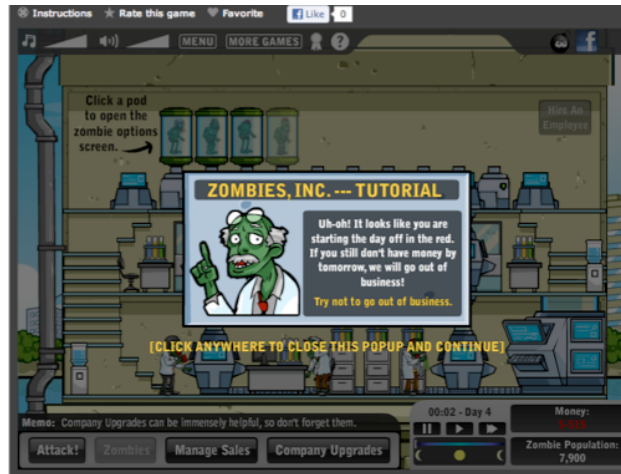
Figure 1. Game 1 - Zombies, Inc.

Zombies, Inc. (see Figure 1) and Elephant Quest (see Figure 2) are both released strategic online games, similar in their complexity, and challenge.